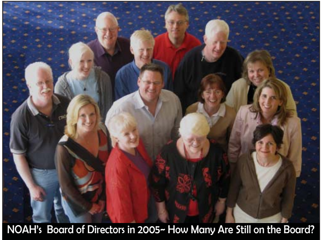
NOAH's Board of Directors in 2005~ How Many Are Still on the Board?