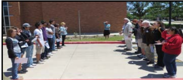
Bioptic training exercise (on foot)

Driver education professionals stress that all drivers, including those with visual challenges, learn how to group critical objects or conditions into three general categories: roadway characteristics, other road users, and traffic