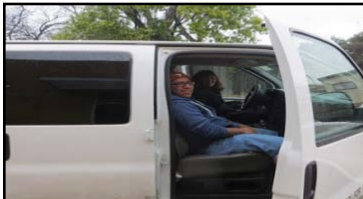
Passenger in-car lesson