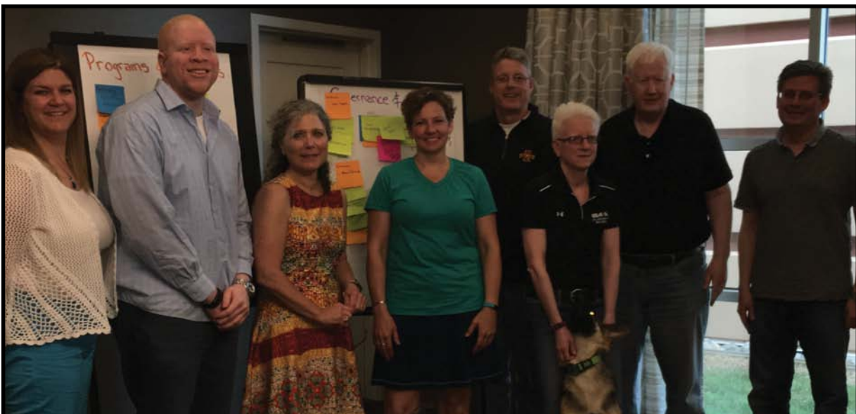
NOAH's Strategic Planning Team in Philadelphia

In many ways, NOAH gives the appearance of a large organization with a significant staff. During a recent conversation, a person with albinism expressed surprise to hear that NOAH is run primarily by volunteers and a small part-time staff. Today, NOAH manages over a dozen programs and is consistently revising and expanding information sources in a variety of media including in print, on the website, and through a strong social media presence.