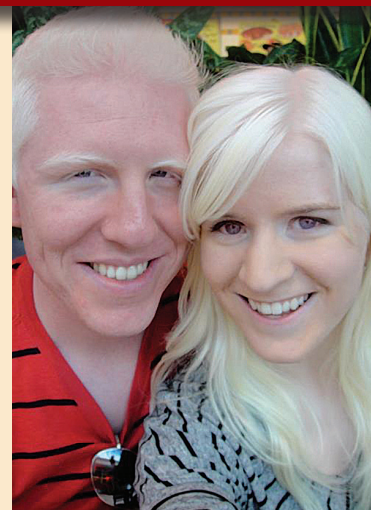
First three photos courtesy of Positive Exposure, Rick Guidotti